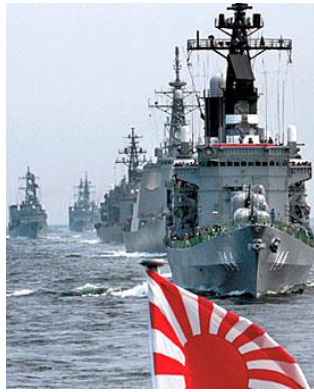
Will Japan try it again?

The nations to Australia's north will invade the continent and bring Australians to their knees. One third of White Australians will die from disease and famine; one third will die directly because of war; and the remaining one third will go into captivity: "and a third part ... shall scatter in the wind; and I will draw out a sword after them" (Ezek 5:2). Massacre and butchery unimaginable will be wreaked upon Australia.