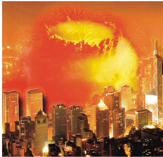
Enemy forces will attack and destroy our nations

For some years the world has been wallowing in the global financial crisis and immense economic downturn that could assist in ushering in a global realignment of political forces. The American government under President Obama recognises this reality and inevitability. In fact, previous American administrations were seeking out and encouraging greater political and military assistance around the world from European allies, Japan and other nations.