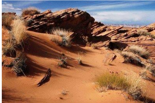
Australia's merciless wilderness

You gather a few belongings and your family crush into your vehicle leaving behind your pet dog to fend for itself. Because you live in a small city, it has not been targeted for destruction like many big cities. With what petrol you have left in the tank you just drive and drive deeper into the wilderness, in the hope that you will find a safe spot.