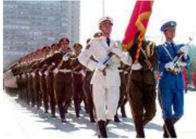
Chinese troops may be part of the occupying forces in Australia

turns very nasty. Anti-American broadcasts, trade wars, sanctions, condemnations of their decadence etc. will be unleashed when Europe sees a weakened North America as a ripened plum, ready for the plucking. God condemns the Anglo-Saxon-Keltic and Nordic nations for making alliances with the gentiles including continental Europeans (Ezekiel 16:28; 23:5-9,12). Instead, it is Israel's duty to lead the world.