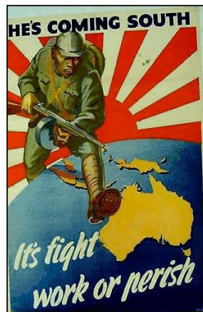
World War Two poster

“We shall die fighting as there is nothing to live for now” he announces. In the radio’s background you can hear the crackle of gunfire as enemy forces ferociously murder their way toward the little radio station.