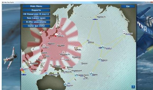
Will Japan try it again – with new allies?

Word is now seeping out that it seems another one third have been killed in the bloody fighting. “Does this mean that the rest of us – one third – will be taken as slaves and scattered throughout Asia” you traumatically think to yourself as you cast a worried eye at your precious wife and lovely children?