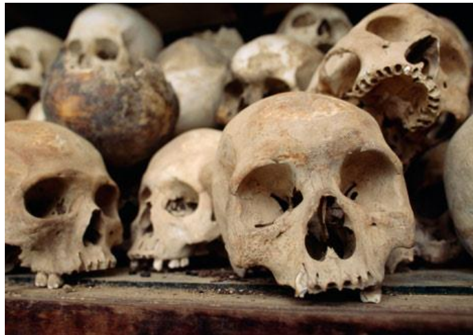
Photograph from the Cambodian killing fields – this time it will be our nations on the receiving end!

After all, a sinister force lurks behind them, urging them on – it is Satan himself. This evil being, with the most twisted mind in the universe, wants to completely annihilate the Israelites after a torturous few years in slave labour camps.