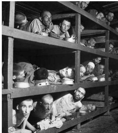
Herded together like animals

The brutality is unbelievable. This brings you to your knees and you cry helplessly. You feel no shame for such conduct. It is a hopeless situation and the future is hell. Your body now shakes all over and the pain is excruciating – like a women in birth-pangs .