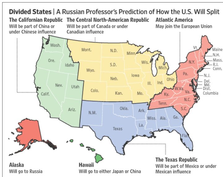
America to be divided up among her enemies! 6

Given such fragmentation and obliteration as a global and even regional power, the protection that Australia once enjoyed will be gone.