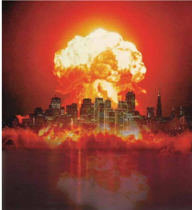
Our cities will be utterly laid waste

So, there could be an end-time period of relative peace and safety for 3 ½ years – centered around covenants (treaties and agreements) followed immediately by 3 ½ years of Tribulation. A world superstructure including extensive trade around the world, delivering massive wealth, yet associated with this will be the growing rivalry between the Anglo-Saxons and Europe.