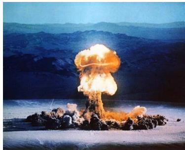
The great cities of Australia will be obliterated

“We are getting revenge on you, Whitey” the invaders scream at the White men. “You ruled the world; now it is our turn. We shall not just control it. But we shall kill every single Anglo-Saxon-Kelt left on the planet. YOUR RACE IS PERMANENTLY FINISHED!”