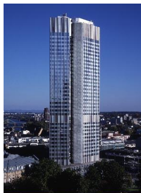
European Central Bank headquarters, Frankfurt, Germany

“For when they say, Peace and safety; then sudden destruction cometh upon them, as travail upon a woman with child; And they shall not escape” (I Thessalonians 5:3).