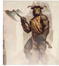
Minotaur (= 'bull of Minos') in Crete.