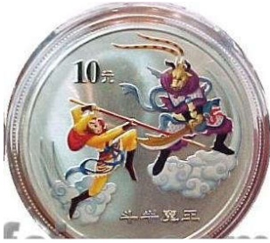
Bull demons in China