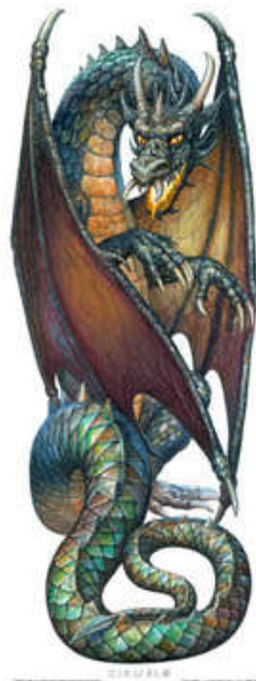
Satan – the Dragon - is the god of this age, exuding his influences across the world

So what is revealed in the Bible on this fascinating and important subject of the spirit realm?