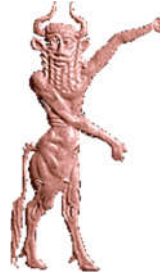
Bull man in Mesopotamia