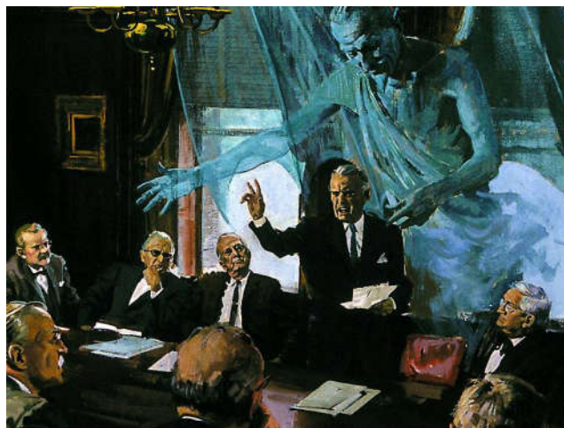
The unseen realm is active in negatively influencing leaders