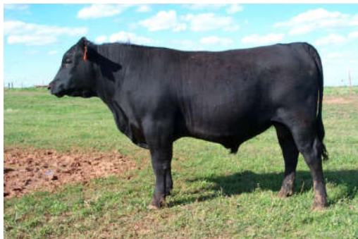
Bulls – symbols of strength and power

The 70 comprises Noah’s 3 sons: Ham (the black-brown race); Japheth (the yellow-brown race); Shem (the white race). In all Noah also had 16 grandsons and 51 other male descendants. These comprise all the gentile peoples.