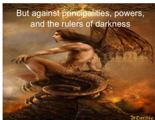
Satan's minions influence this world's governments and corporations

Consider also, just as cherubim have four heads, could this particular class of 70 Princes have bull heads?